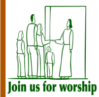
Join us for worship

Welcome guests! We are happy you joined us this morning for worship. We hope you will also join us after service for fellowship and coffee. Should you wish to make a donation to the church, you may use the pew envelope in the back pocket of the worship binder.